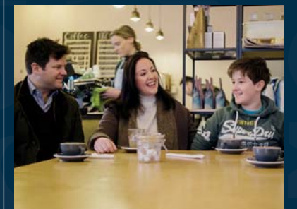
The Wheelers A local family

We moved with the family from London, I have an easy commute to Belfast for work and the best thing is I feel like I am on holiday every evening when I get home.